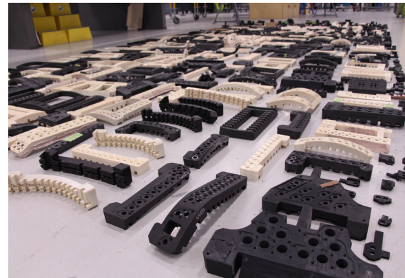
A sample of 3D printed drill guides used in the production of the XB-1 demonstrator aircraft.

Using just one typical drill guide as an example, Boom saved approximately $3,700 in material cost and reduced lead time from weeks to days. Considering that over 700 drill blocks have been 3D printed in the production of the XB-1 demonstrator aircraft so far, the material cost savings is significant. The lead time savings between in-house 3D printing and machining also has a substantial positive impact on the production schedule.